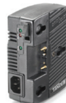
Tandem® 70 70 Watt AC Power Supply and Charger