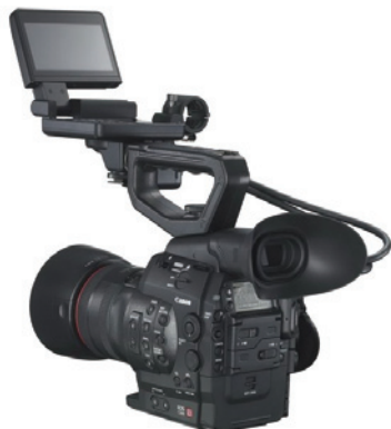
Canon EOS C300

The QRC-CA940 provides the convenience of powering the Canon EOS C300 via a DC connector, as well as having 3 PowerTap outputs for powering accessories such as monitors and recorders to help simplify on-set battery management and reduce down time when changing batteries.